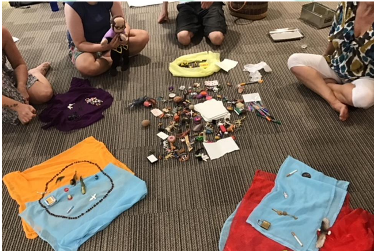
In this session, participants chose objects that best represented themselves

The final celebration session provides provide closure and begins the after-care programme. It takes place several months after the initial course has finished, before all participants watch our professional Autumn show, their third theatre trip as part of the programme.